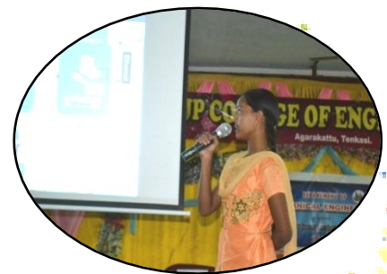
Paper presentation was given by other college students