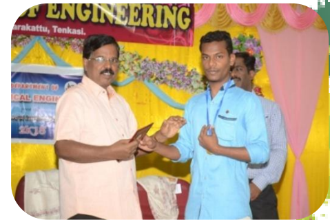
Prize distributed for class toppers