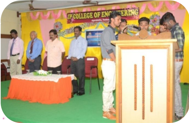
Program started with prayer by third year students.